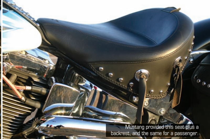
Mustang provided this seat plus a backrest, and the same for a passenger.