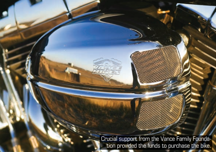
Crucial support from the Vance Family Foundation provided the funds to purchase the bike.