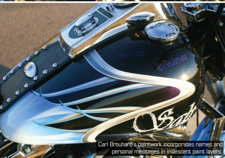
Carl Brouhard's paintwork incorporates names and personal messages in iridescent paint layers.