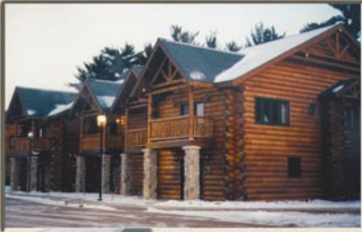
12" Cedar Embossed Hardboard with Round corner posts - Solid Olympic stain