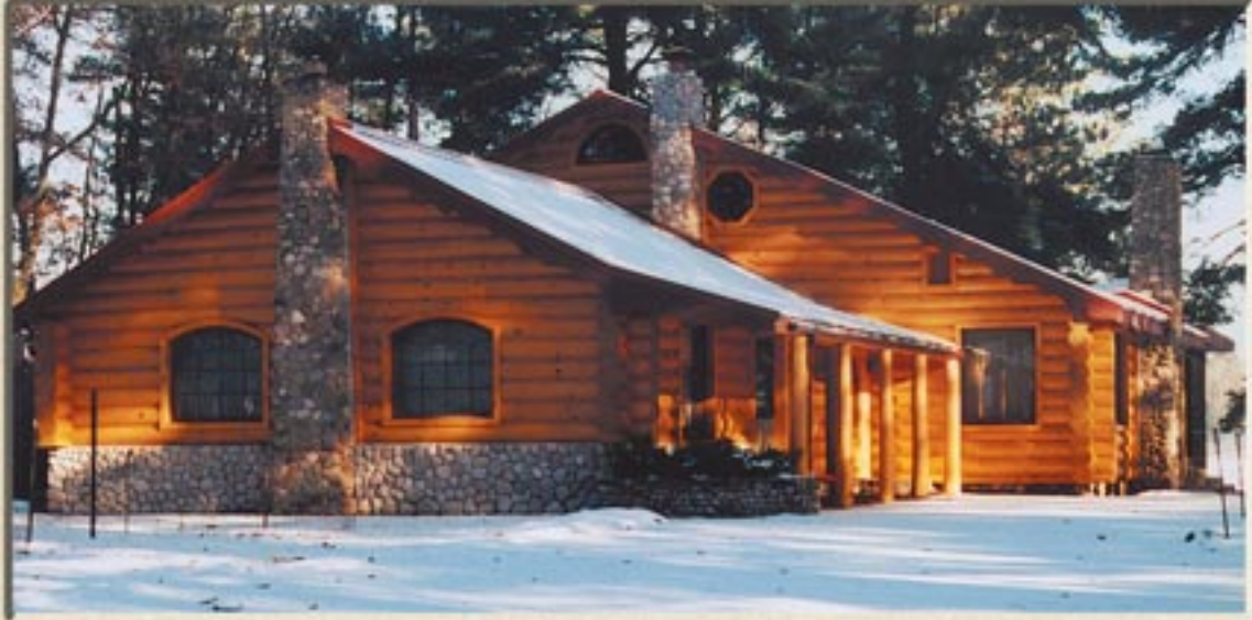
12" Smooth Pine with Saddle Notch corners - Sandy Creek

H&L INDUSTRIES, INC. is the manufacturer and leading provider of large-diameter, log building systems that conserve valuable timber and energy resources. Company headquarters are located on 12 acres in the northern Wisconsin community of Solon Springs. The 17,000 square-foot complex includes a state-of-the-art pre-finishing facility.