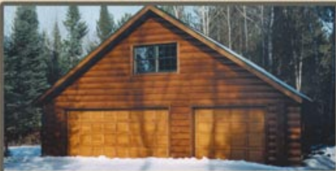
12" Peeled Pine with Saddle Notch corners - Auburn Ridge