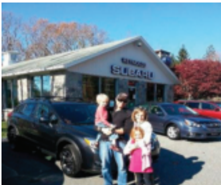
The Cook family purchasing their new Crosstrek!

We are really excited to announce the arrival of the all new 2013 XV Crosstrek. Based on the award winning Impreza platform, the Crosstrek has finally filled the gap in our line for customers looking for versatility, ground clearance, and maneuverability without moving up in size to an Outback or Forester. You'll find our trademark Boxer 4 Engine Under the hood, and up to 51.9 cubic feet of storage space in Subaru's latest model. The Crosstrek also utilizes our Lineartronic Continuously Variable Transmission (CVT) to achieve a class leading 33 highway MPG and a powerful, smooth, responsive driving experience. Like the majority of our line, the Crosstrek is also PZEV certified, making it one of the cleanest crossovers on the road! Featuring Bluetooth, steering wheel mounted audio controls, alloy wheels, cruise control and roof rails as standard equipment means that you'll be getting a tremendous value in an amazing car that starts at just $21,995. Also available are options like leather seating, power moonroof, all weather package, navigation and rear view backup camera along with a bevy of accessories to give you the exact car to fit your needs. Give us a call or just stop by to take a look and test drive one!