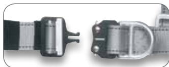
Quick connect buckle on leg straps