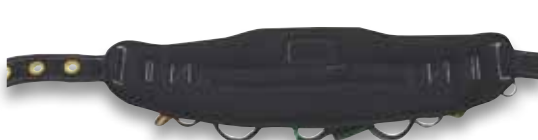
Drilex liner on Deluxe back pad wicks moisture away from the body.