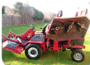
Toro GM 580-D