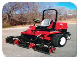
Toro ReelMaster 6500 4WD