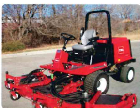
Toro Grounds- master 4100