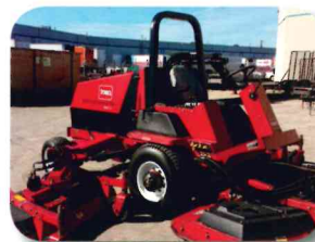
Toro Grounds- master 580