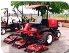
Toro Grounds- master 4500-D