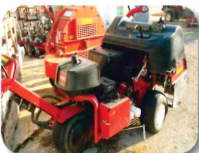
Toro ProCore 648