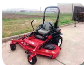
Toro Z-Master w/ 72" deck & Kohler 34hp