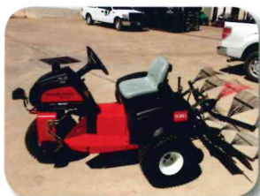
Toro SandPro 5040