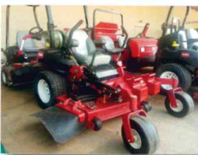
Toro Propane - Z mower w/60" deck (123 hours)