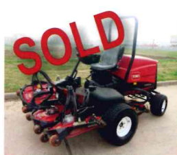
Toro GM 4300 (2011)