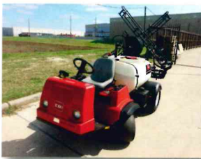
Toro MP 1250 Sprayer (2009)