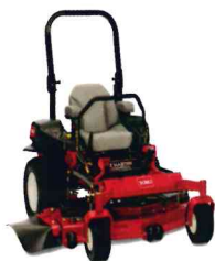
New Horizon™ technology on Professional 6000 - Page 3