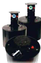
Toro Infinity Sprinklers - Page 2