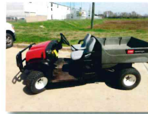
Toro Workman MD (2009)