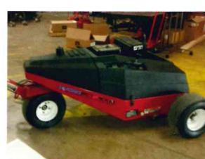
Toro Hydroject 3000 (1995)