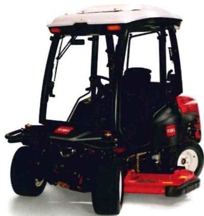
With optional cab

When you combine the agility of a zero-turn riding mower with the flexibility of an out-front rotary mower, you get serious productivity. Now there's an option to stretch that productivity even further. Toro has announced a new 100-inch cutting deck option for the popular Groundsmaster 360, allowing both wide-area mowing and trimming with one machine.