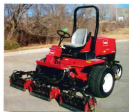
Toro RM 6500 4WD (2013)