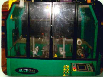
Foley 632 Reel Grinder w/AccuTouch Screen