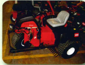
Toro Sand Pro 3040

2008; Front Blade, Tooth Rake, Mid Mount, Lights, New Engine