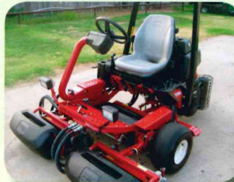
Toro Greensmaster 3150 Triplex w/ Gas Engine

2013; 644 hrs; 11 blade reels, Groomers, Lights