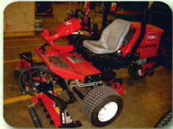
Toro Reelmaster 3100D

2011; 342 hours; 8 Blade, 27" Cutting Units