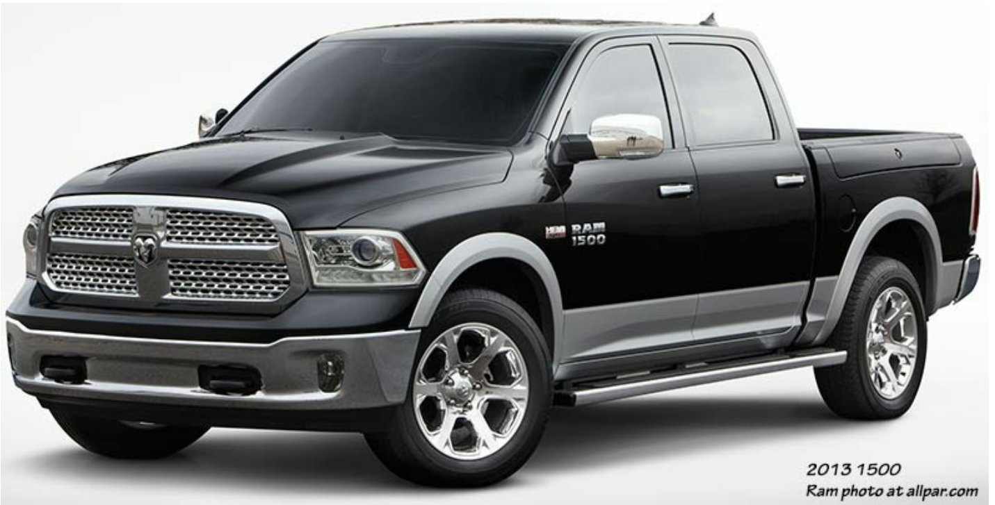
2013 1500 Ram photo at allpar.com