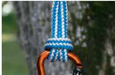
Arbormaster® Girth Hitch