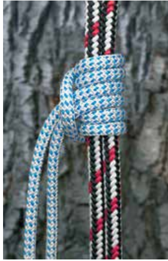
English Prusik Hitch