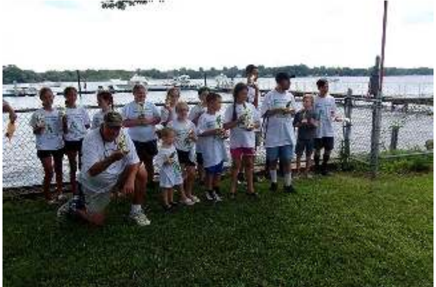
Youth participants with their trophies and T-shirts