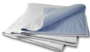
Underpads (disposable or reusable)