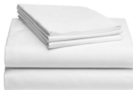
Fitted Sheets (beds require 'twin XL' size sheets)