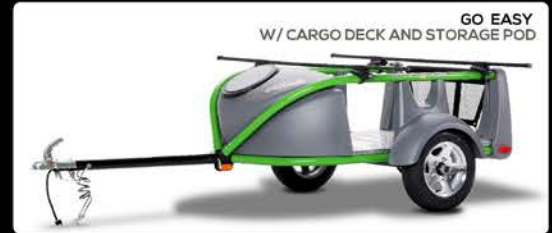
GO EASY W/ CARGO DECK AND STORAGE POD