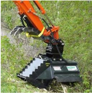
Rotary Cutter, SS