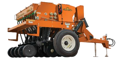
Seeder, Std Turf, 5'-6'