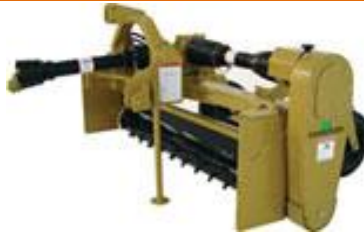
Power Rake, 4'