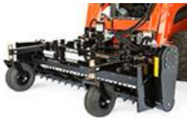
Power Rake, 6'-Skid Steer or Tractor