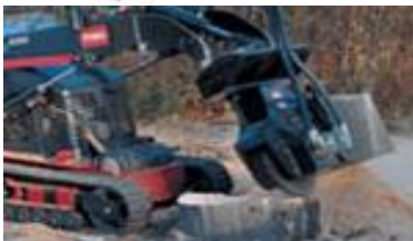
Stump Grinder Attachment-Dingo