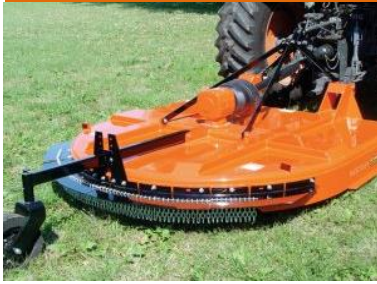
Rotary Cutter, HD 3-point