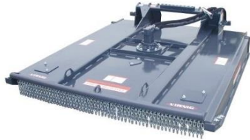
Rotary Cutter, LD 3-point