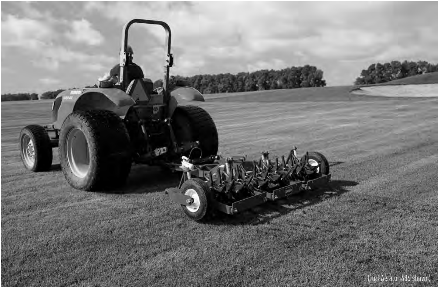
(Turf Aerator 686 shown)

The 686 and 687 Turf Aerators give excellent depth performance and follow ground contours, vertically and horizontally, like no other aerator available.