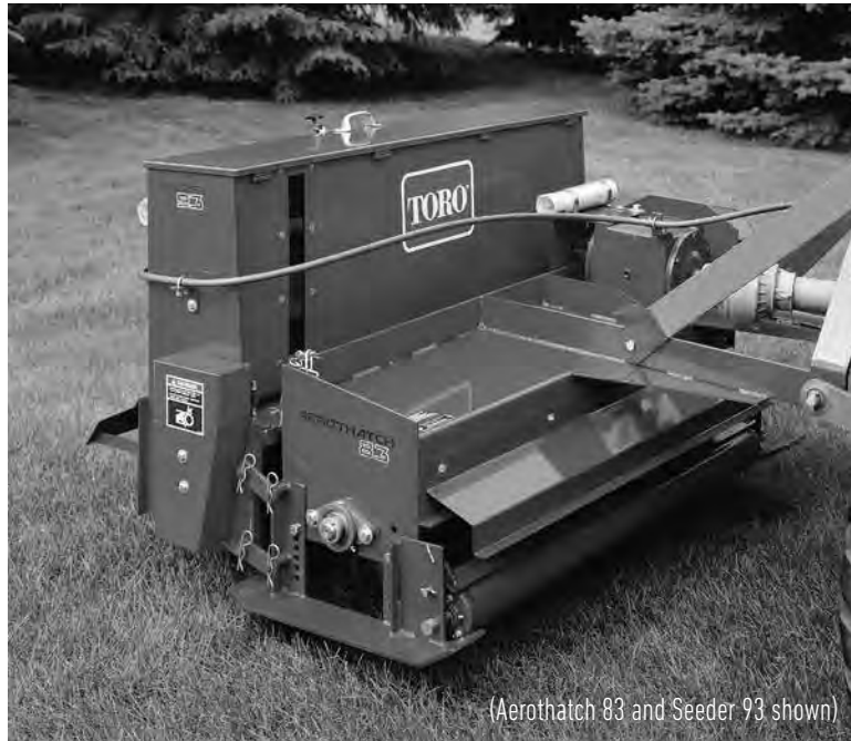
(Aerothatch 83 and Seeder 93 shown)

Provides relief from troublesome thatch and compaction and slit seeds all in one pass.