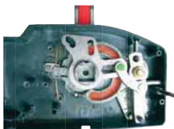
Push to Open