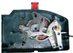
Pull to Open

Replacement 7 Pin Harness: 688-82586-21-00