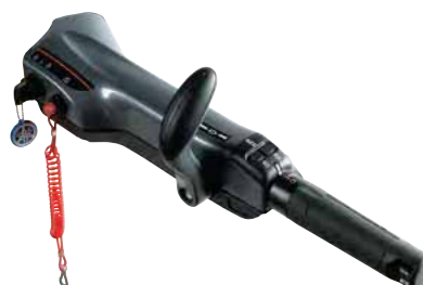
Tiller Handle Main Assembly

The tiller handle main assembly requires the use of a fitting kit below to mount to a Yamaha Outboard.