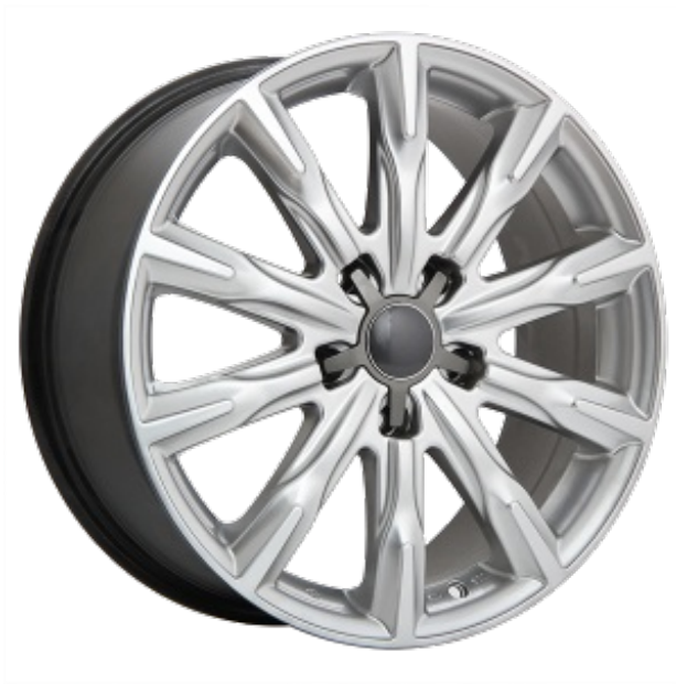
REPLICA 10 SILVER (ADD $25 PER RIM FOR THIS ONE)