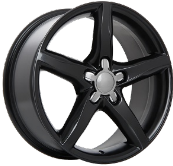
REPLICA 14 GLOSS BLACK