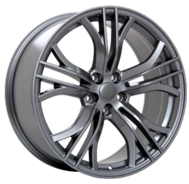
REPLICA 35 GUN METAL (ADD $50 PER RIM FOR THIS ONE)