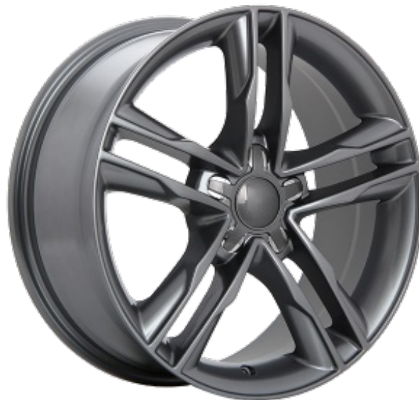
REPLICA 13 GUN METAL