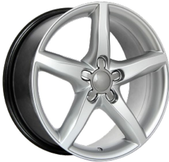
REPLICA 14 SILVER