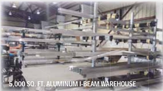
5,000 SQ. FT. ALUMINUM I-BEAM WAREHOUSE

With state-of-the-art manufacturing facilities in Miami and Clearwater, Florida, we utilize more than 60,000 s.f. of building space. Our manufacturing equipment is the most current available and operated by trained experienced employees who are dedicated to producing top quality products. In order to ensure fast delivery, we have a fleet of 16 delivery trucks that cover Florida daily. So whether you own a 10' jet ski or a 45' powerboat. Continental Trailers has a model to fit your needs.