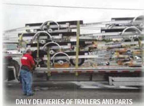
DAILY DELIVERIES OF TRAILERS AND PARTS