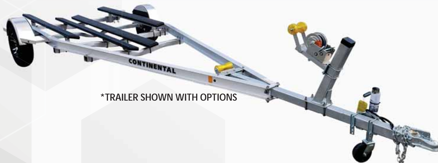
*TRAILER SHOWN WITH OPTIONS