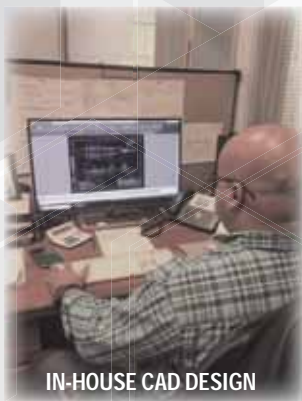
IN-HOUSE CAD DESIGN